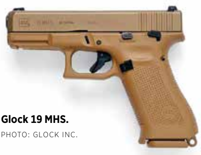
Glock 19 MHS.

Glock was also one of two finalists in the U.S. military XM17 Modular Handgun System trials to select a new joint service pistols for the U.S. Army, U.S. Air Force and U.S. Marines. The winner of the com-