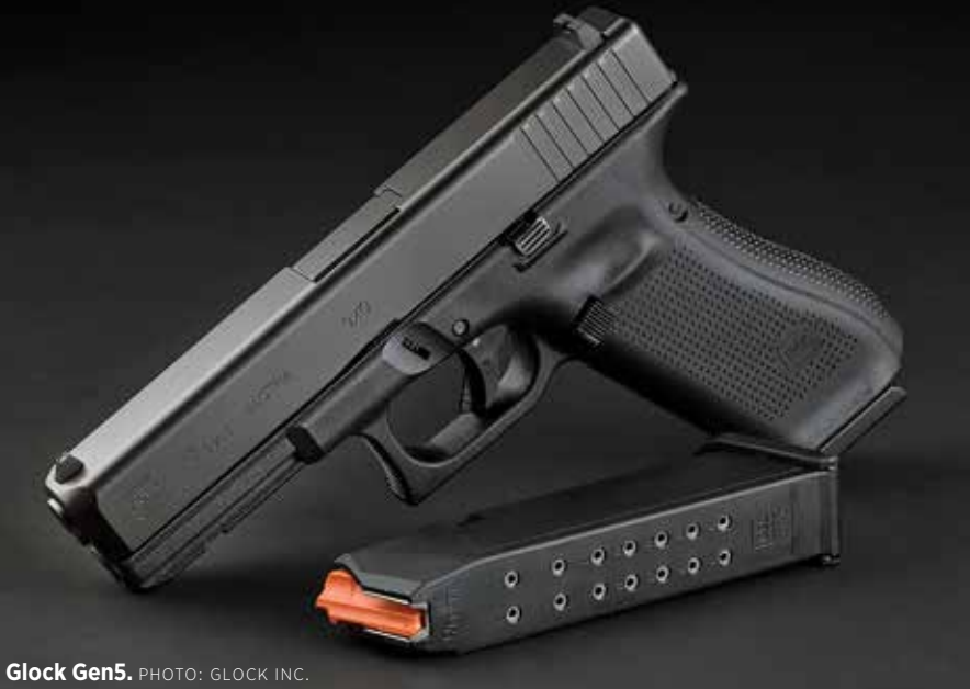
Glock Gen5.

some would arguably call the first good-looking Glock handgun. Originally designed for the FBI contract, the 17M used most of the features of Glock's Gen5 model, released in August 2017: