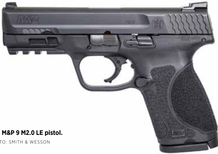
The M&P 9 M2.0 LE pistol.