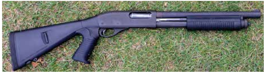
A police shotgun.

In previous Blue Line head-to-head holster tests, we found the only advantages of the Blackhawk holster to be that they were cheap and could be purchased anywhere. But most agencies found that holsters bought for cheap (and practically at your local convenience store) are not necessarily the ones that stand up to the rigours of dynamic training plus daily shift