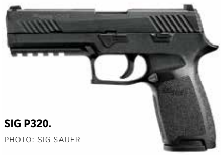
SIG P320.

pistol competition to become the new M17 joint service sidearm. Blue Line tests of the P320 demonstrated the excellent feel of the grip and very smooth trigger pull, but the high bore line resulted in more muzzle flip than a Glock. The forward centre of gravity also caused it to feel initially awkward in the hand, especially with a light attached to the forward frame rail.